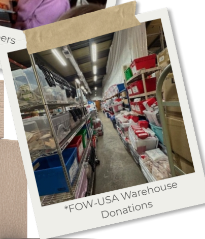
*FOW-USA Warehouse Donations