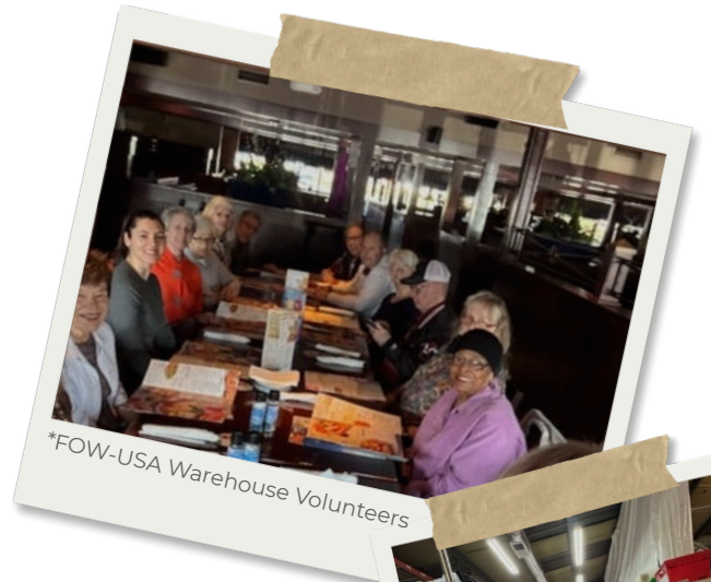
*FOW-USA Warehouse Volunteers

To detail our warehouse duties, volunteers assist with box cutters opening shipped donation boxes, sorting, counting supplies, packing supplies and placement of packaged products into manufacturer's labeled storage bins according to size, shape or color, emptying trash bins, even sweeping the floor. Below I have detailed how an order is filled. Our WOCN and RN volunteers assist with all the above plus answer any questions regarding whether a product is for ostomy use or not. If products are not needed they are placed in a special bin to be shipped to another volunteer program to put to use. FOW-USA only deals with trusted medical recipients in overseas distribution of our supply shipments.