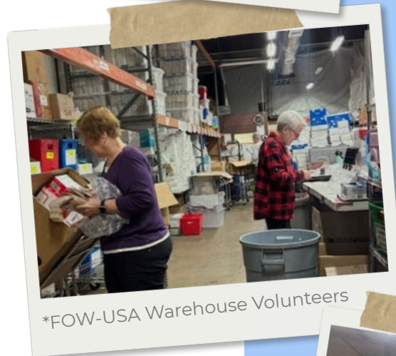
*FOW-USA Warehouse Volunteers