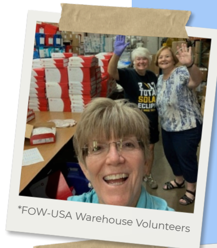
*FOW-USA Warehouse Volunteers