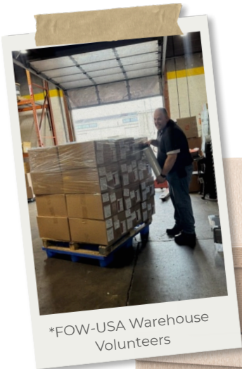
*FOW-USA Warehouse Volunteers