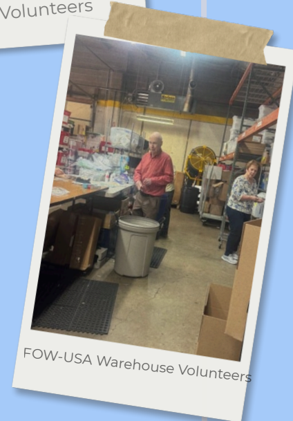
FOW-USA Warehouse Volunteers