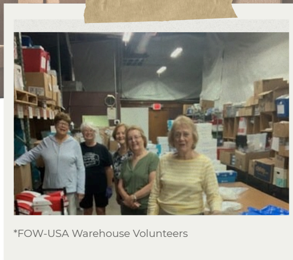
*FOW-USA Warehouse Volunteers

I'm sure many of you have heard of Kentucky's Bourbon Trail. Let me share with you FOW-USA's Product to Developing Country Trail: