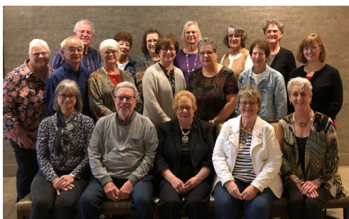
FOW-USA Board of Directors