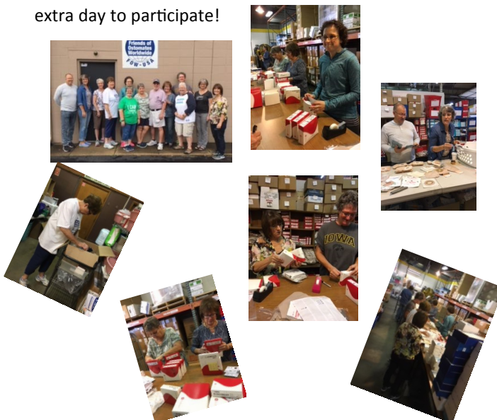
“Orientation for new board members”

As our tradition continues, we followed our annual FOW-USA Board of Directors meeting in Louisville, KY in October with a warehouse visit and orientation of the warehouse operations for the new board members. Unpacking, staging and repacking supplies is always so gratifying not to mention reading some of the accompanying letters in the packed supplies we receive. Thank you all who stayed an extra day to participate!