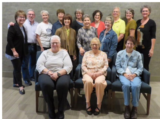
2018 Board of Directors